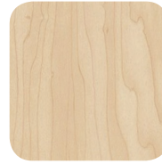
MANITOBA MAPLE 7911-60