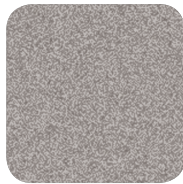
GREY NEBULA 4622-60