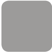
LIGHT GRAY T47