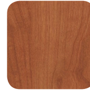
WILD CHERRY 7054-60