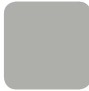
DOVE GREY D92-60