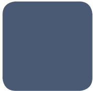
TECH BLUE T42

The paint samples shown are for representation purposes only and are not a true match. Contact our Customer Service Department if actual samples are required.