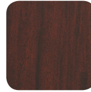
FIGURED MAHOGANY 7040K-78