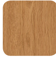
SOLAR OAK 7816-60