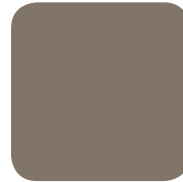
TAN METALLIC T56