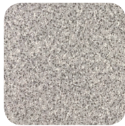
WHITE NEBULA 4621-60